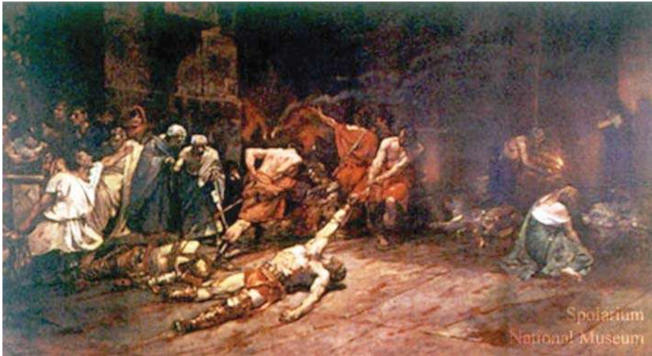
Juan Luna's Spolarium 1884.