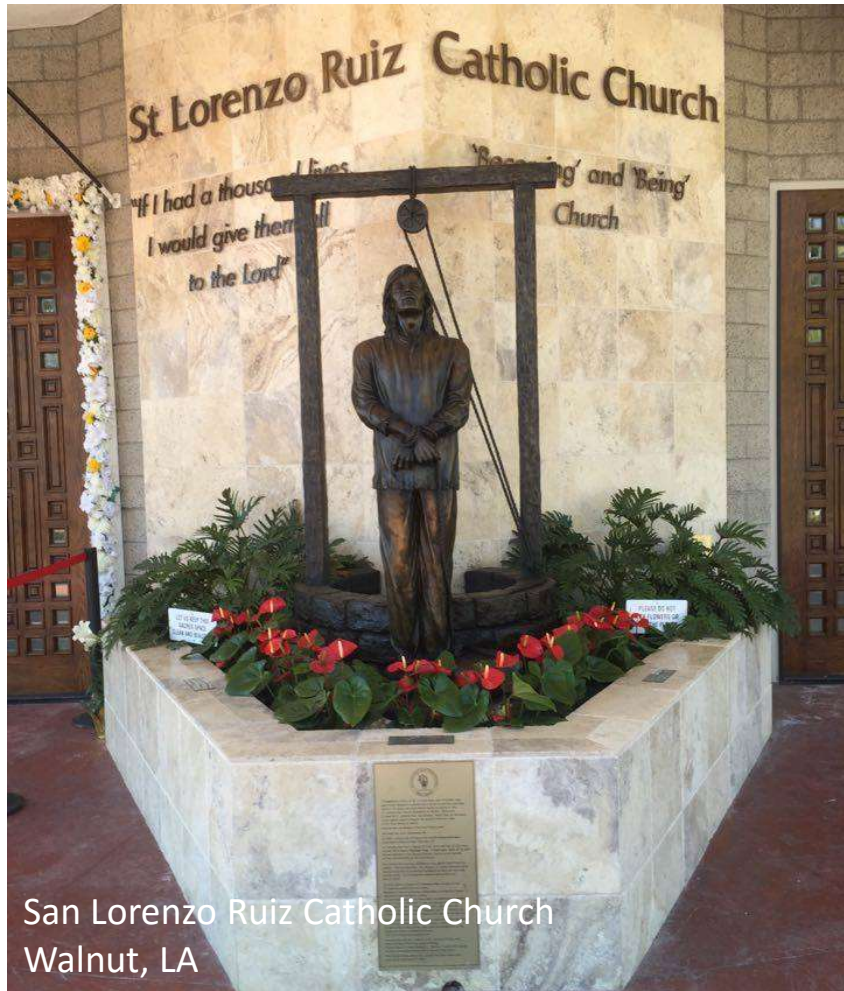
San Lorenzo Ruiz Catholic Church Walnut, LA