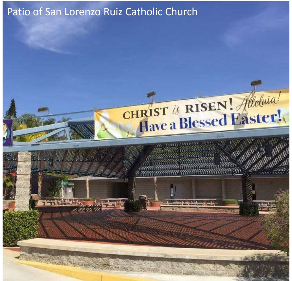
Patio of San Lorenzo Ruiz Catholic Church